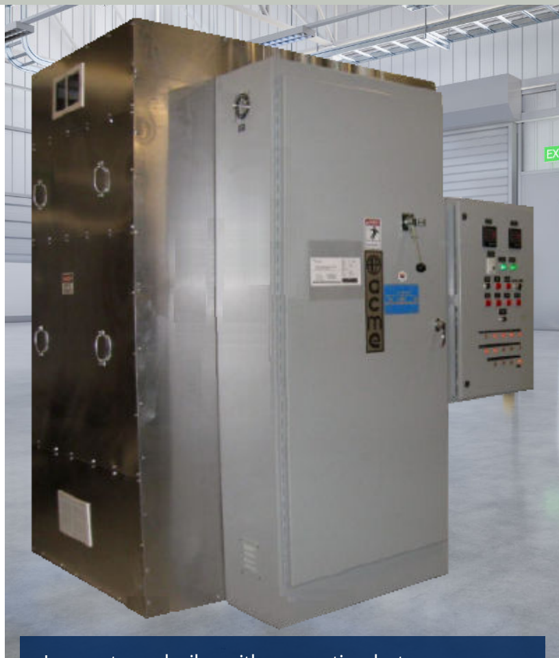
Large steam boiler with separation between power and control panel

ACME boilers are manufactured under rigid progressive quality control.